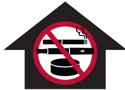
This is a Smoke-Free and Vape-Free Home